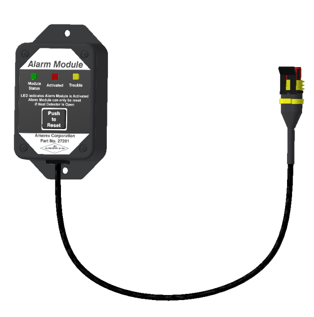
PN: 27201 - Alarm Module

The Amerex Alarm Module provides a field service technician the ability to load test fire control panel actuation circuits using a resettable, battery powered device. During testing or trouble shooting, the Alarm Module is installed in the actuation circuit and simulates the normal and fired operation of an actuation device without the danger of false discharge. The module is powered up via an internal lithium AA sized battery only when connected to a control panel and goes into sleep mode when disconnected. A flashing green LED on the face of the module and a corresponding green System OK LED at the control panel indicates normal system operation. By testing the Fire detection circuit, the Alarm Module will indicate a Red LED corresponding with an Alarm condition on the control panel. This indicates the Alarm Module has activated due to an accurate voltage and current load at the actuator. If the Alarm Module yellow Fault LED is on, this indicates a low voltage or low current load which may not properly actuate the fire system. If the Alarm Module remains installed for 15 minutes with no activity, it will revert to a Fault condition. The Fault condition is displayed at the module and at the system control panel. This feature prevents the Alarm Module from accidentally being left in the place of the fire system actuator.